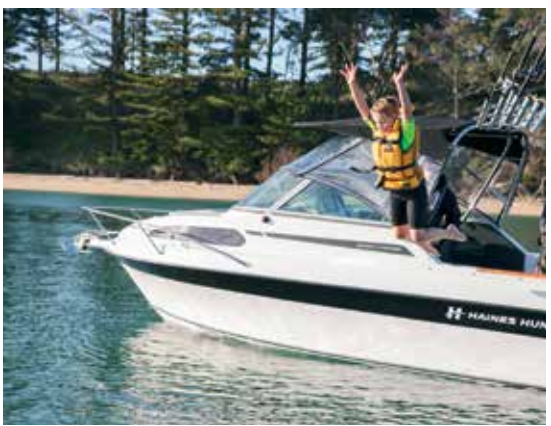
A day on the water with family and friends is hard to beat!