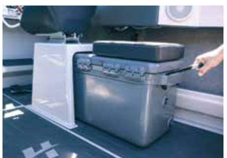
Fishing, biscuiting, water skiing, or just chilling with the family, a Haines Hunter adapts to just about any activity on water.