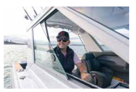
Choose from an Open or Enclosed Lockable Cabin.